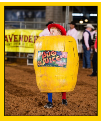
Sept. 15-23, 2017

Amarillo Tri-State Exposition www.tristatefair.com