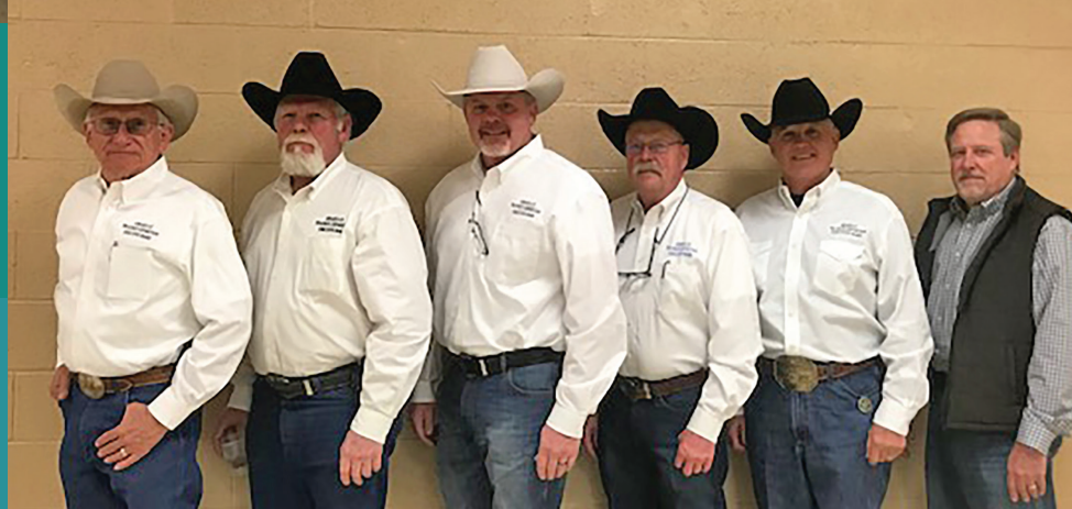
2019 Officers (above):