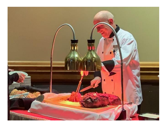
2022 Menu, page 22

Served with a green peppercorn brandy sauce