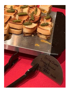
2022 Menu, page 24