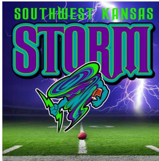
Southwest Kansas Storm Webpage

The Southwest Kansas Storm arena football team is returning in 2023 and the newly created Kansas Bandits indoor soccer team has claimed Dodge City as home for their inaugural season. Both teams have posted their upcoming schedules, with home games being held here at United Wireless Arena. Season tickets and individual games will be going on sale soon!