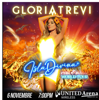
GLORIA TREVI SUNDAY, NOVEMBER 6