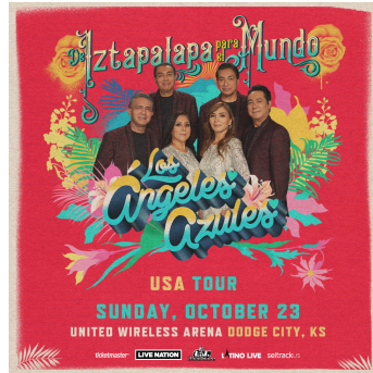
LOS ANGELES AZULES SUNDAY, OCTOBER 23