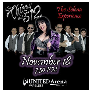
LOS CHICOS del 512 THE SELENA EXPERIENCE