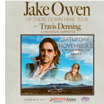
JAKE OWEN SATURDAY, NOVEMBER 5