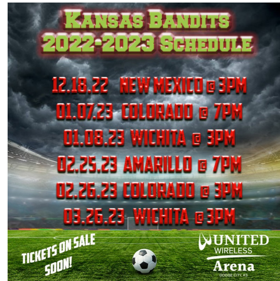
Kansas Bandit Soccer Webpage

Follow us on Social Media for Arena updates!