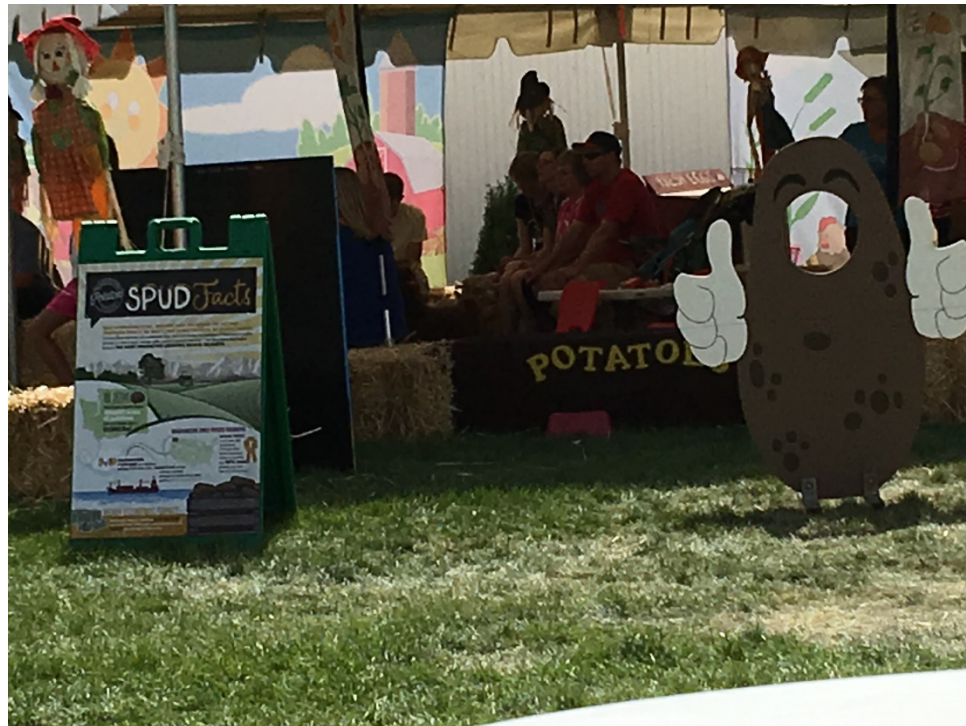
If people have fun, they won't even know they are learning