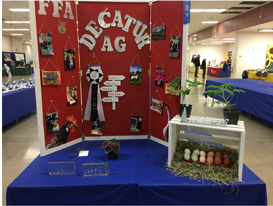
Attractive and Interactive