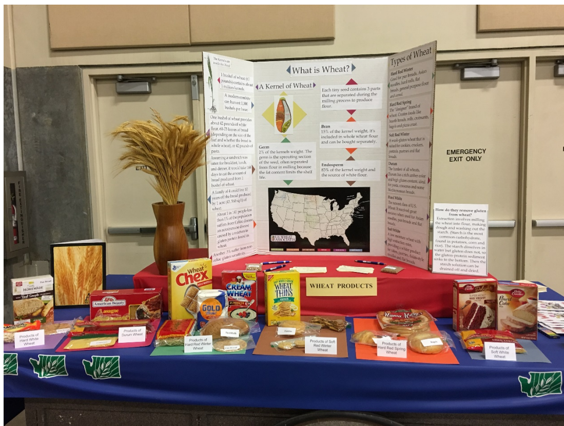
While not the actual Agriculture Display, this was very educational and a good example of an engaging display