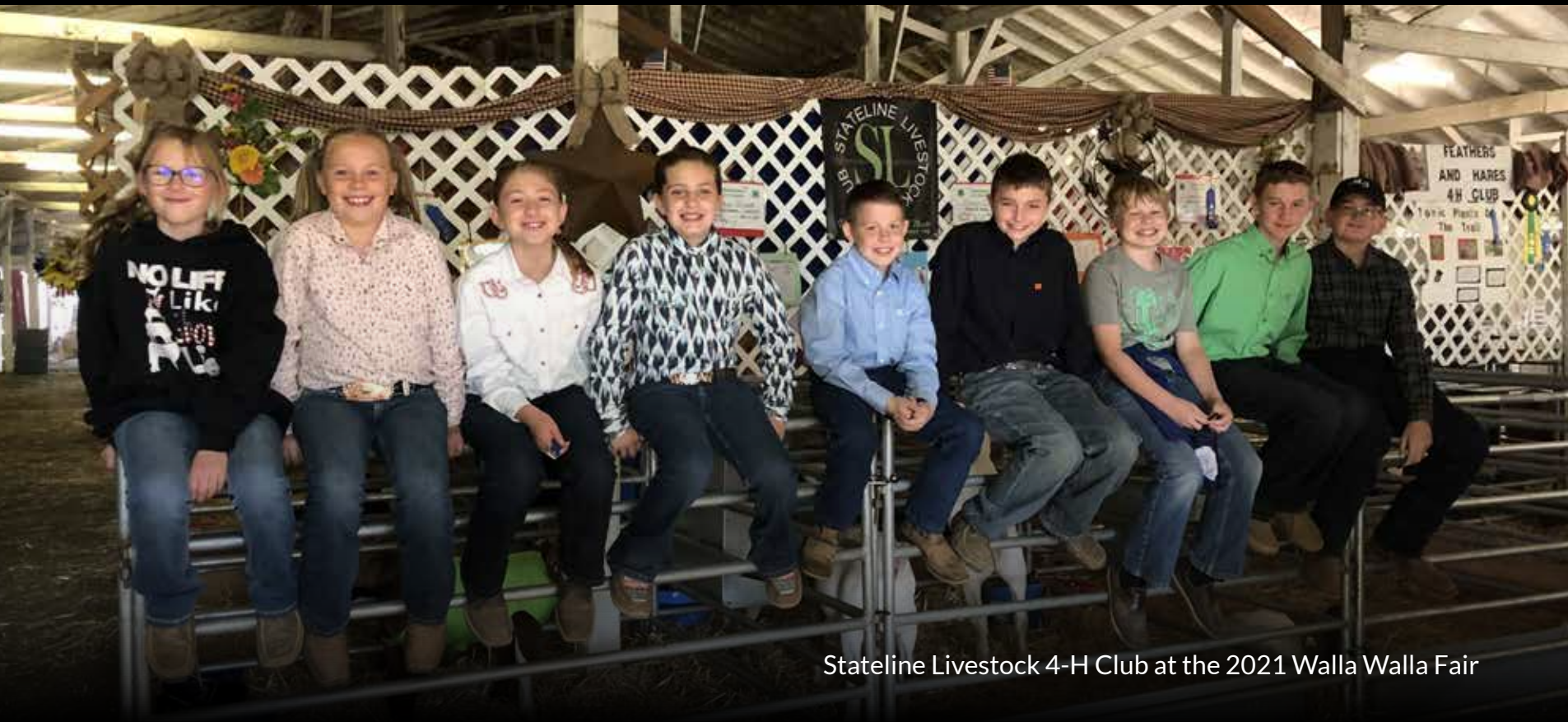
Stateline Livestock 4-H Club at the 2021 Walla Walla Fair

Personal | Home | Business | Ag Banking & Lending