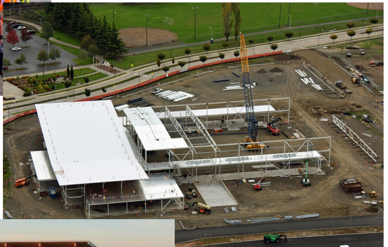
Below November 22nd, 2019