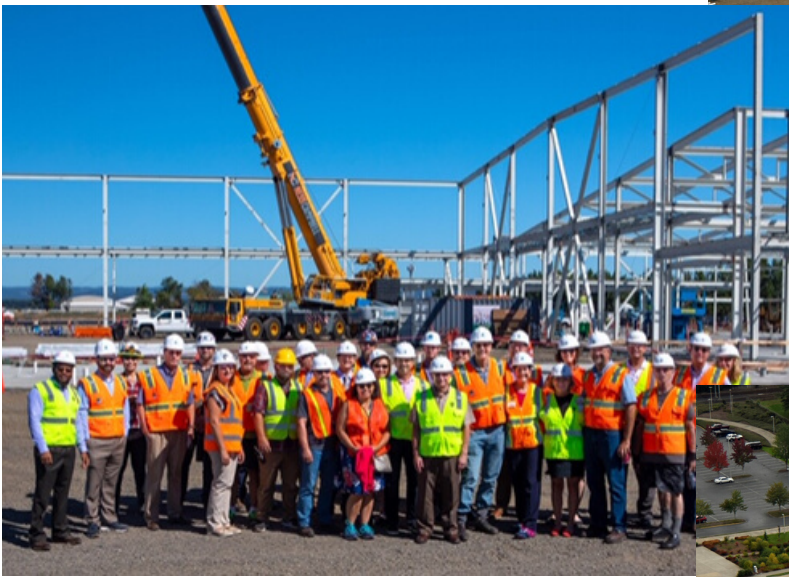
Left- Early September 2019 Below- Mid- October 2019