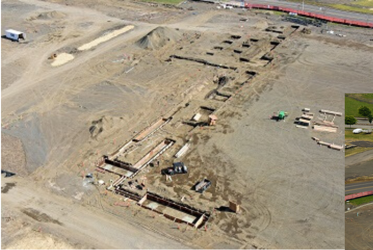
Left- March 2019 Below- July 2019