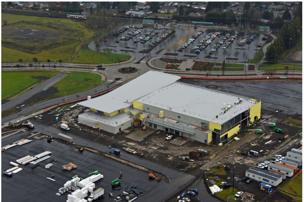
Above- View of Loading and Expo areas in progress