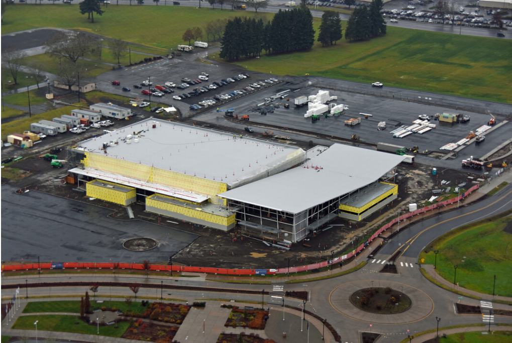
Left- View of Entry from Veterans Way