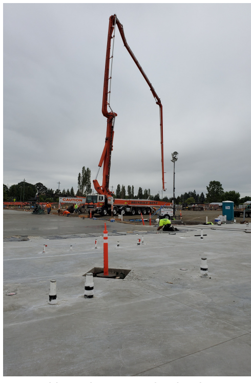
Taking advantage of a dry day to pour concrete-