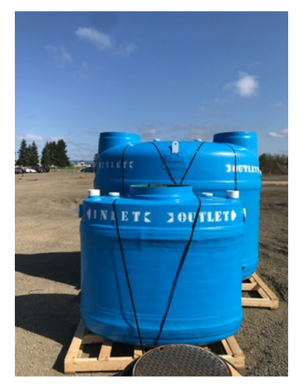
Pump station plumbing arriving on site