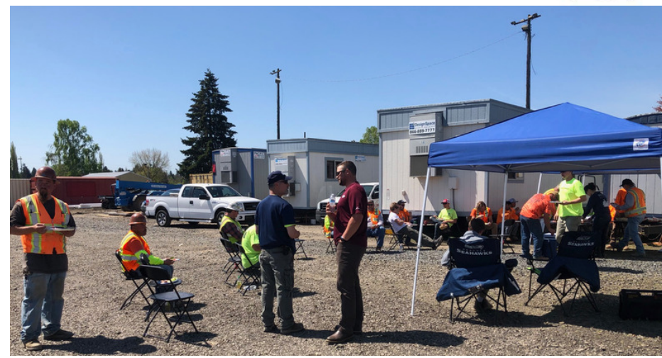
Project trade partners enjoy a safety barbeque to celebrate a perfect safety record on the project so far.