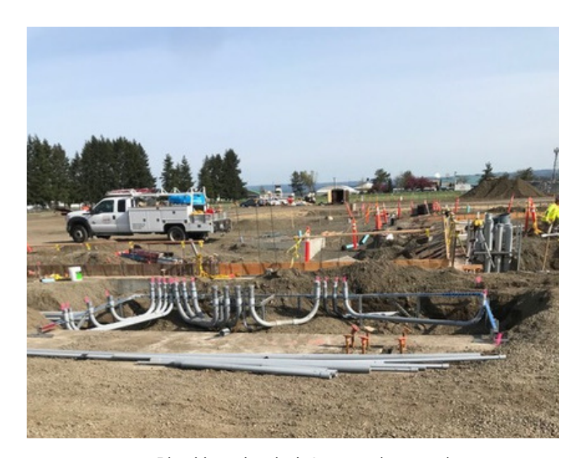
Plumbing, electrical, & gas underground installation at the kitchen

- Concrete foundation being poured and finished- Over 900 cubic yards total!.