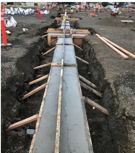
- Concrete foundation being poured and finished- Over 900 cubic yards total!.