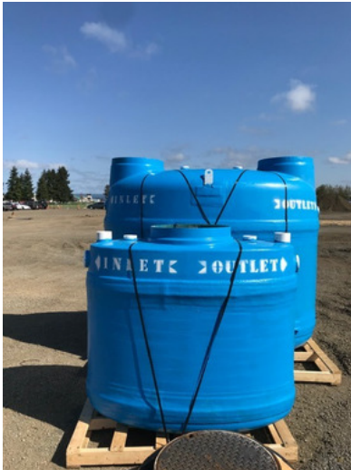
Pump station plumbing arriving on site