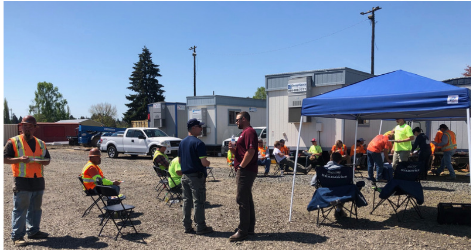
Project trade partners enjoy a safety barbeque to celebrate a perfect safety record on the project so far.