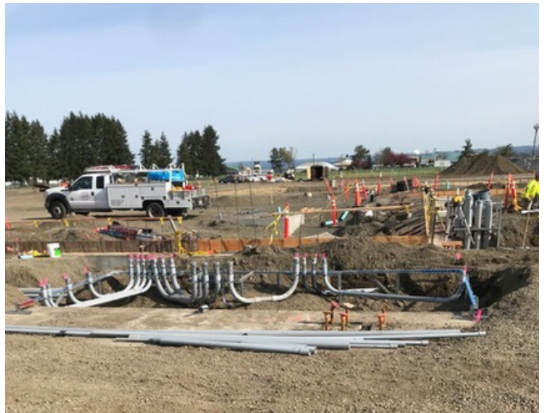
Plumbing, electrical, & gas underground installation at the kitchen