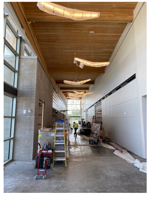
Pictured above and left - Rigorous work proceeds at the Wingspan