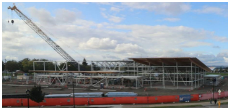
late Sept 2019