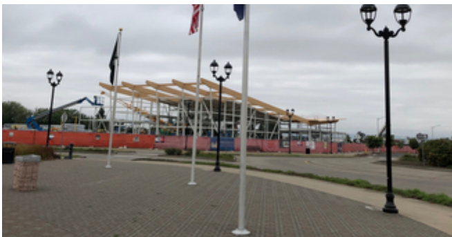
Early Sept, 2019