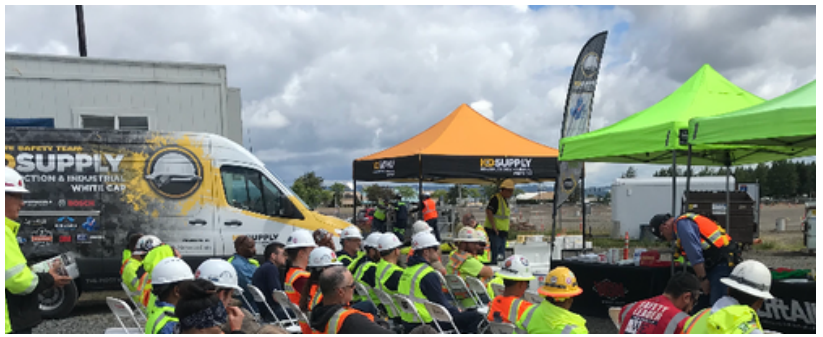
Above: Recent safety "lunch and learn" event for the project team