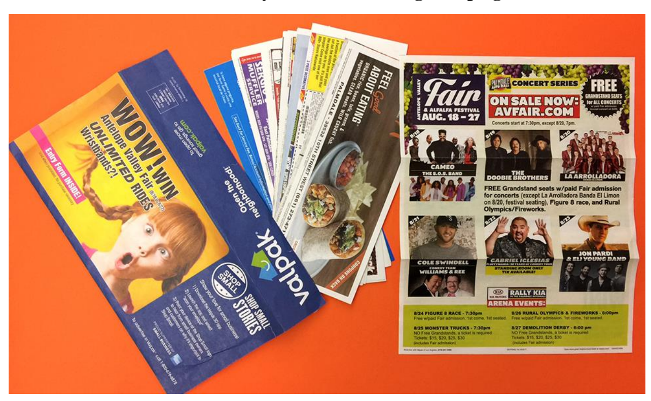
Division 6 - Any Other Advertising Campaign

Image of little girl/verbiage (above) was placed outside of the Valpak mailer envelope sent to 130,000 residents of the Antelope Valley. The image and call to action offer had to be compelling to get recipients to open the mailer to see how to win a pair of FREE A.V. Fair UNLIMITED Carnival Ride wristbands.