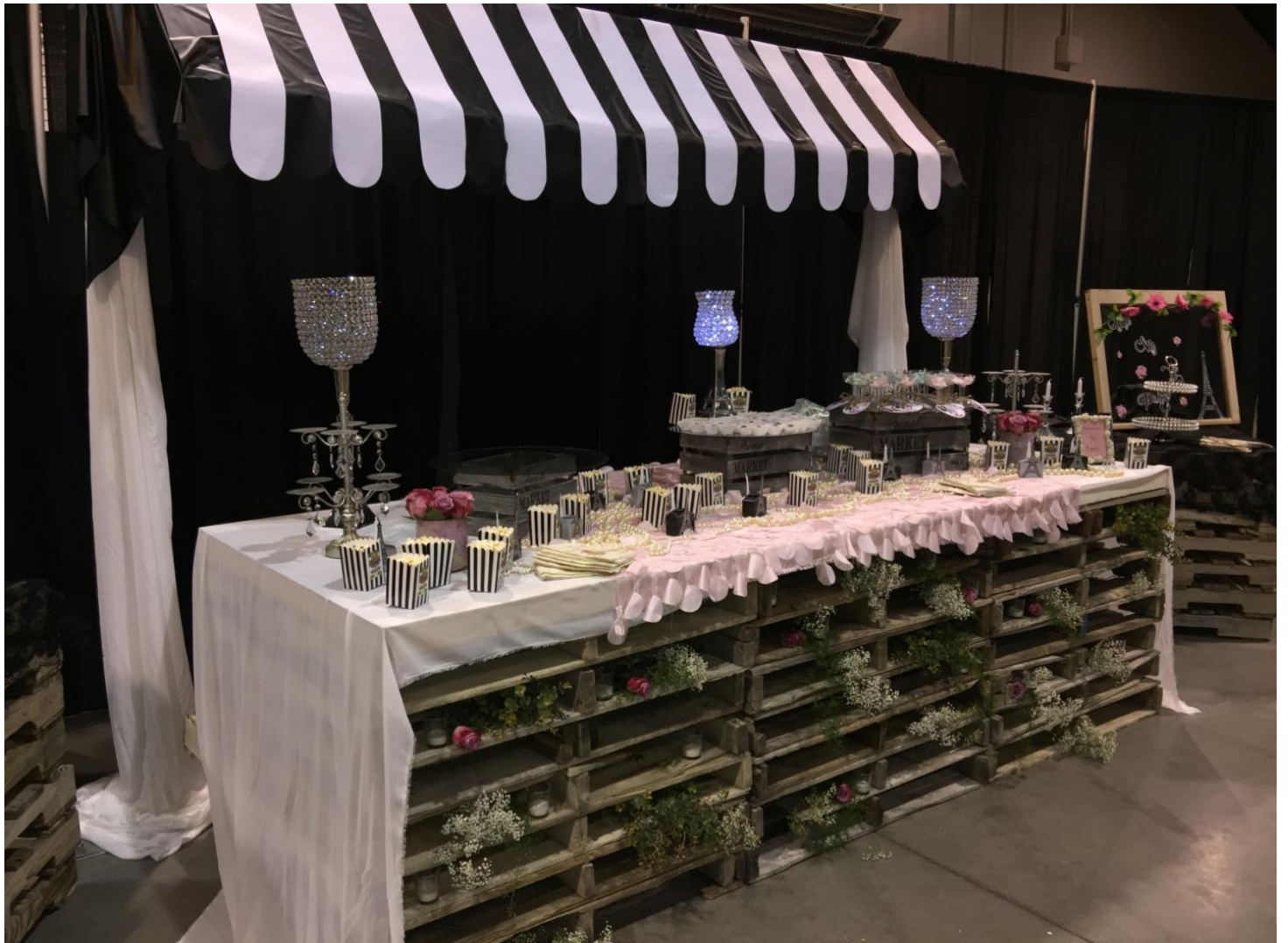
Macarons, Cream Puffs, Cupcakes, pink and blue Cotton Candy and Popcorn