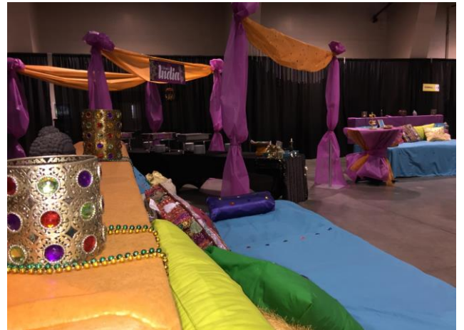
INDIA: Tandoori Chicken, Jasmin rice, & Naan