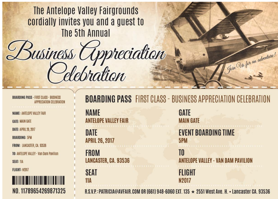
Front and back of Business Appreciation Celebration Invitation