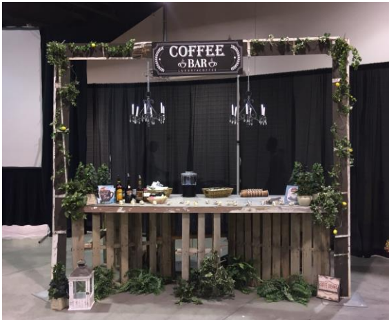
Cappucino, Baileys Irish Cream, & Whipped cream