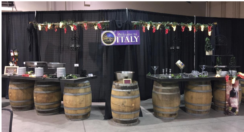
ITALY: Chicken Alfredo, Deep fried Ravioli, Antipasto platter, and Sangria