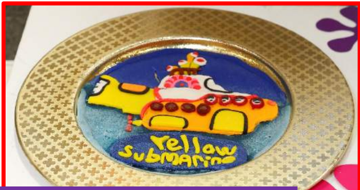
Play Doh® Creations