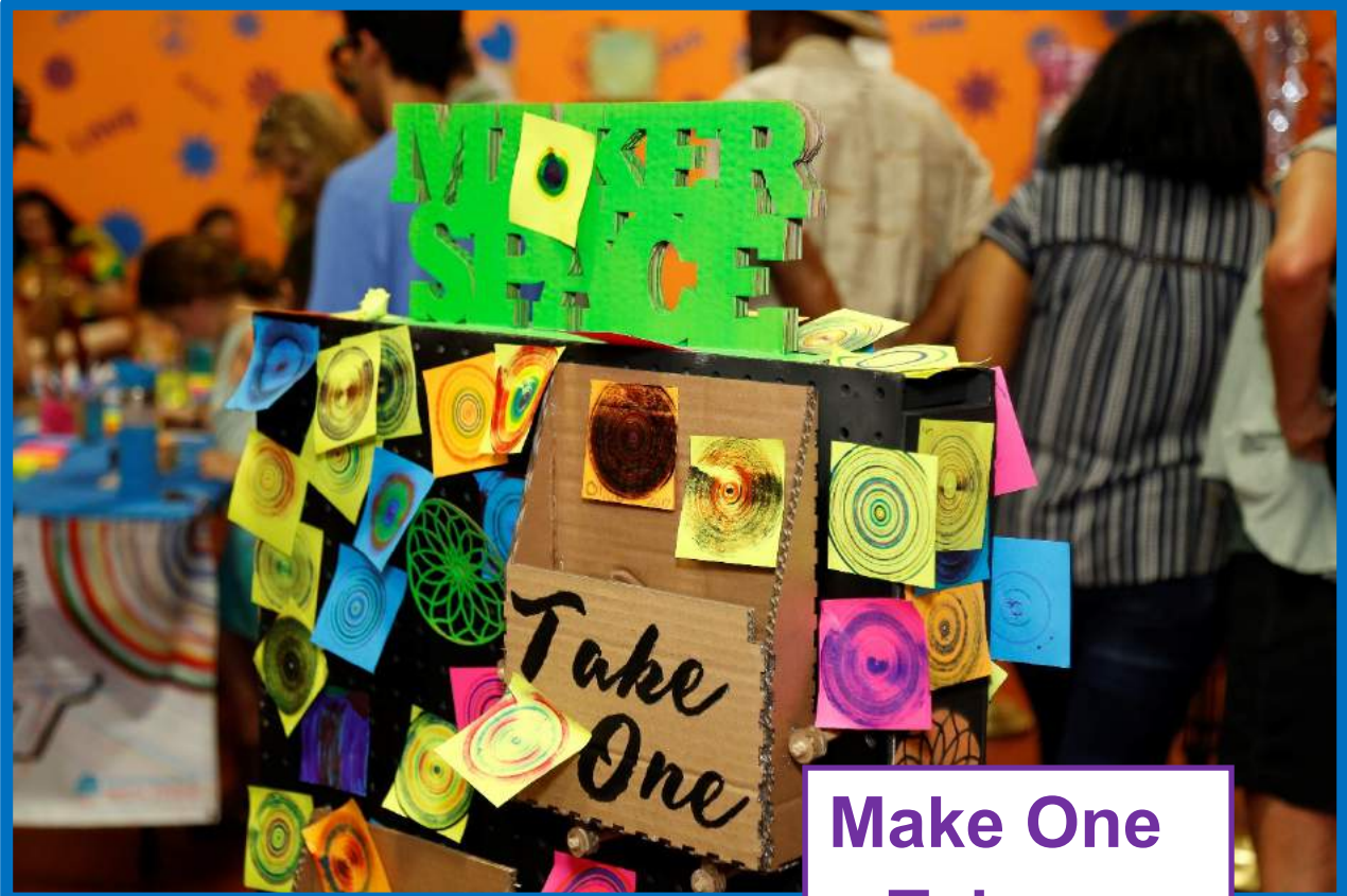
Make One – Take one