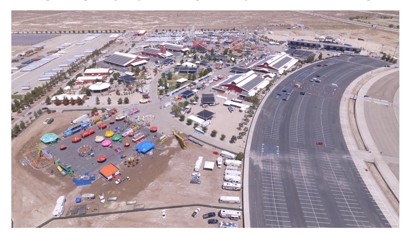
Photo take from the Kid Zone (Kiddie) Carnival end of the fairgrounds.

Drone photo of parking lot, grounds, and part of the grandstand arena for future plans.