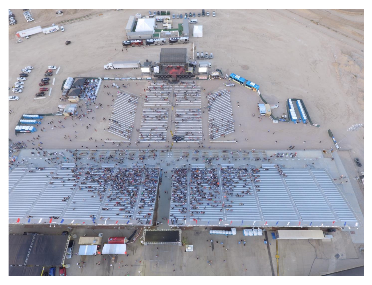
Aerial of grandstand/trackside seating, and concert stage/backstage areas.