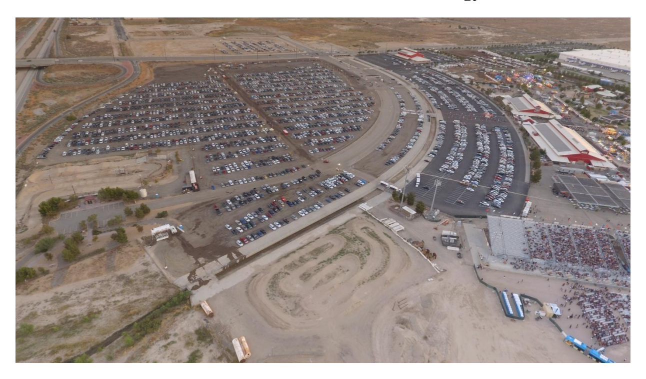
Division 18. New Innovative Use of Technology Photos

Drone photo of parking lot, grounds, and part of the grandstand arena for future plans.