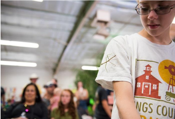
Held twice daily, an interactive demo taught Fairgoers about the good, bad and ugly of the insect world.