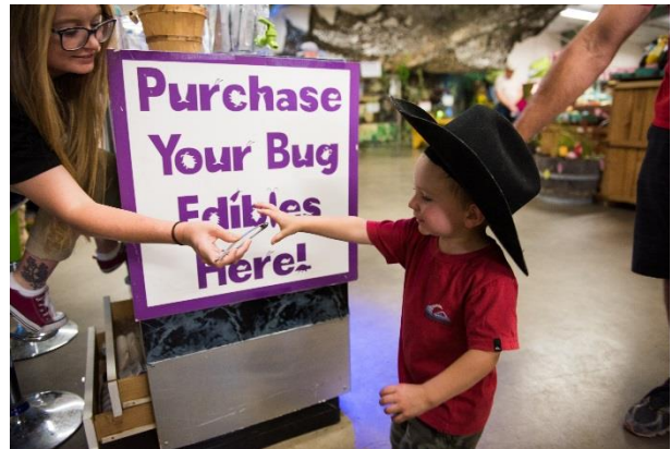
Adventurous fairgoers young and old could taste bugs for free or purchase some to take home.