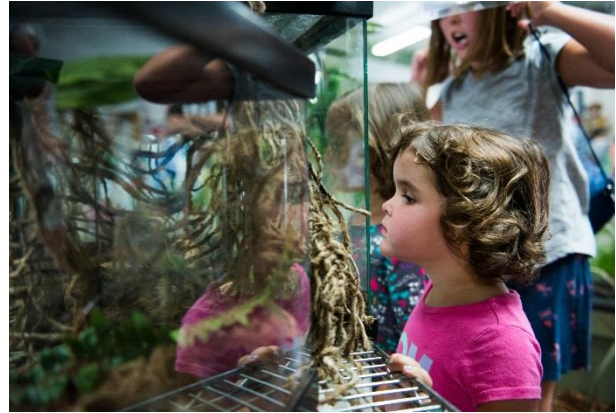
A young Fairgoer peers in at one of the more than 350 bugs on display.