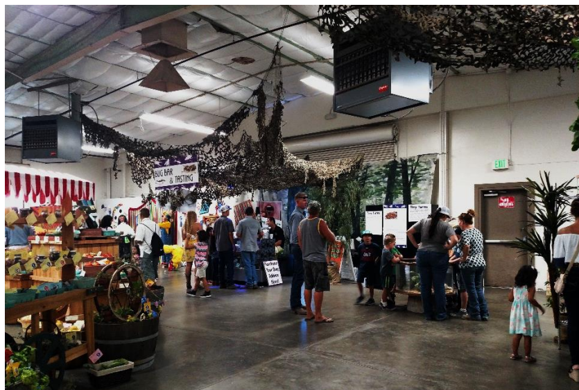
A jungle-theme was used throughout the exhibit with backdrops and hung camo netting.