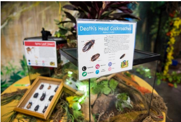
Colorful educational signage was posted for each of the 30 species of insects on display.