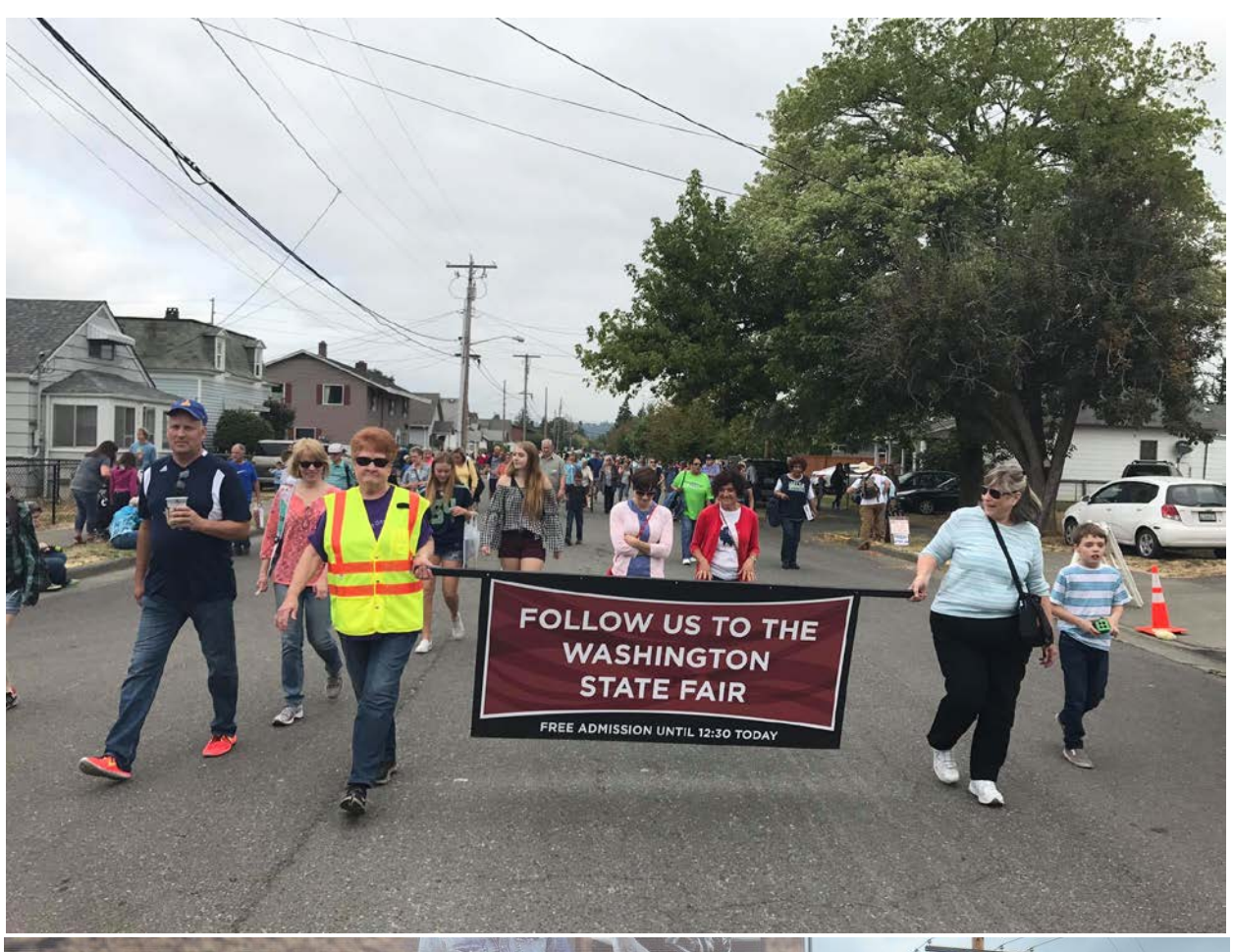
Washington State Fair – Division 19: New Community Outreach