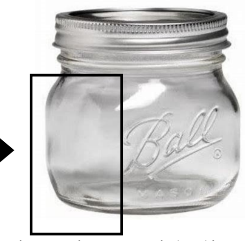
There must be an area on the jar with no writing or decoration for judges to be able to clearly see the product inside.