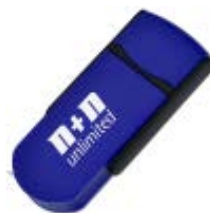
Multi-tool w/built in Tape Measure