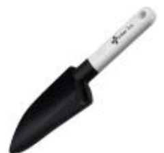
Plastic Garden Shovel