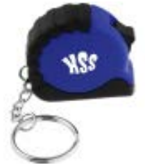
Mini Tape Measure