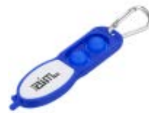
Push Pop Fidget Pen w/Caribiner