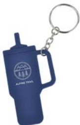
Tumbler Key Chain

Your company name and/or logo will be placed on the item of your choice, and these will be handed out as patrons enter the fair for a one day give-away.