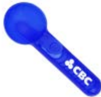
Ice Cream Scoop