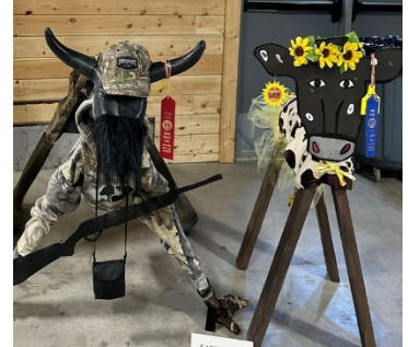
Example of Sawhorse Decorating