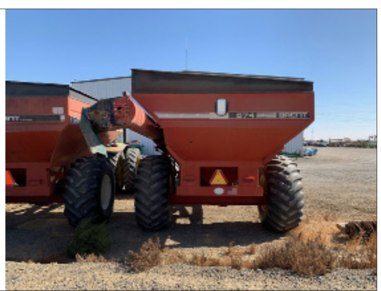
Bankout Wagon 13 ft wide