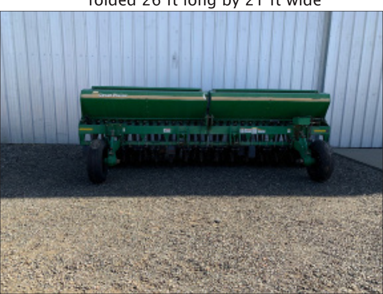
Small grain drill 15.5 ft wide, 6 inches off the ground