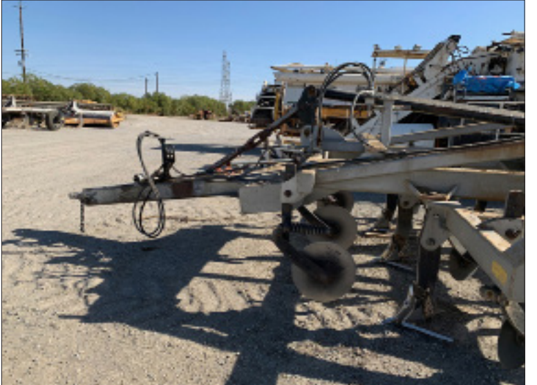
Implement to rip alfalfa and chisel-Front Section See back section above 2 of 3 photos