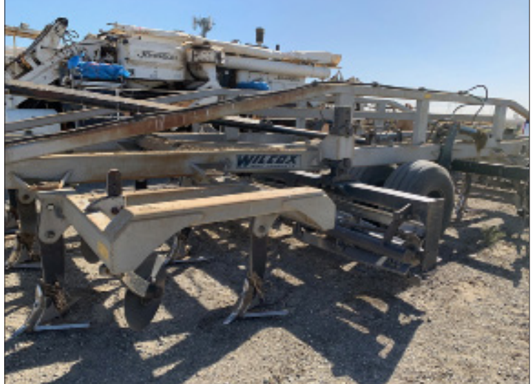
Implement to rip alfalfa and chiselMiddle SectionSee back Section above3 of 3 photos