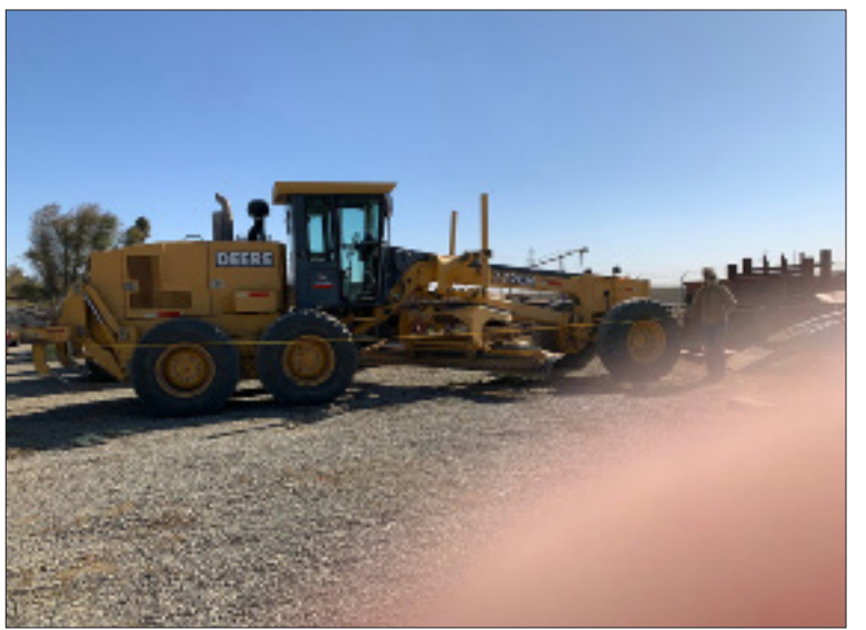
Road Grader and Blade Grader 30'3" long Blade 14/1" wide