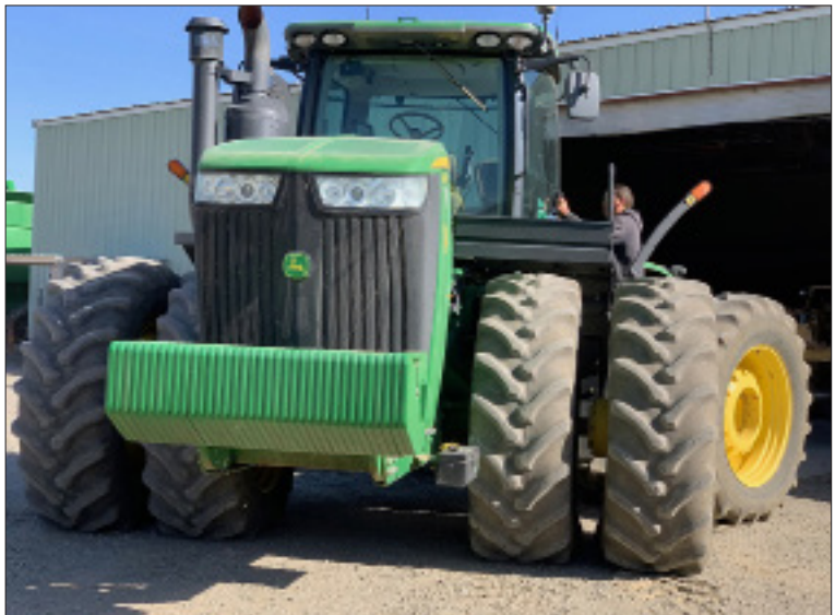
John Deere 9410R Tractor with Duals 15'2" wide, 17' 6" with step