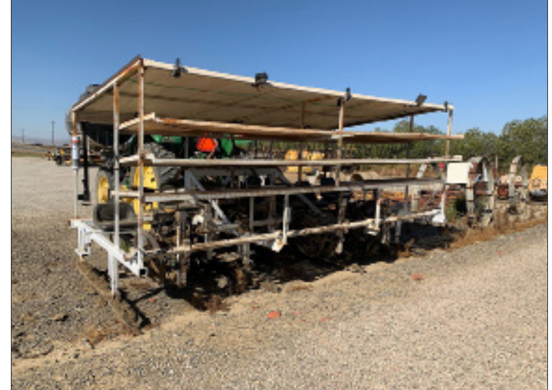
Planter Sled 15 ft wide 6 – 8 inches off the ground