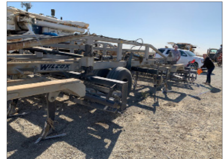
Implement to rip alfalfa and chiselBack Section42' long x 17.5 ' wide1 of 3 photos