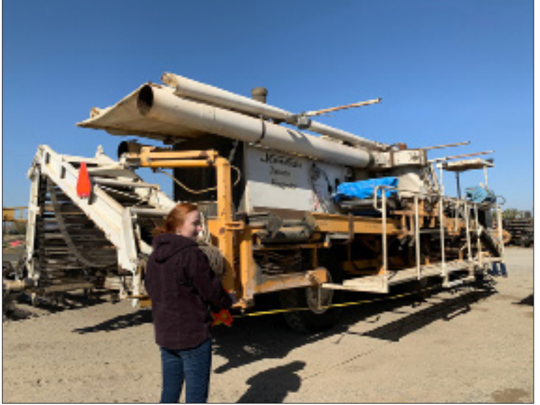
Tomato Harvester 41 ft long x 16 ft wide