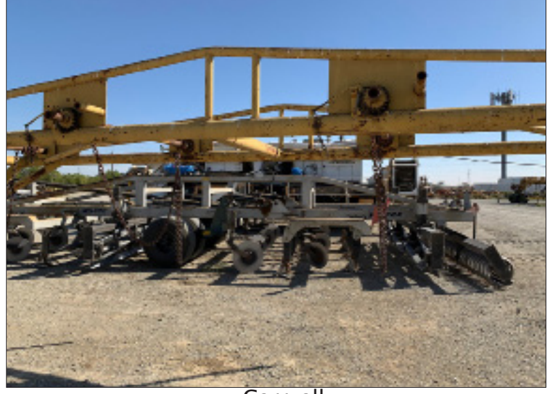
Carryall Photo with implements that could be transported