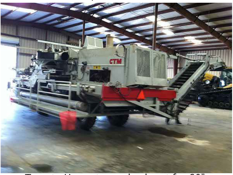
Tomato Harvester – wheels set for 60" beds. 54' long x 11 ft wide, plus elevator