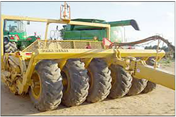
Scraper for land leveling 18 ft plus tractor