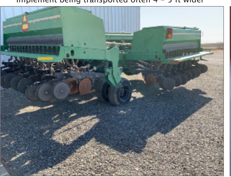
Grain drill folded into three sections Side 1 Folded 26 ft long by 21 ft wide