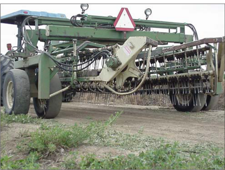
Alfalfa Rake tines 7" off the ground