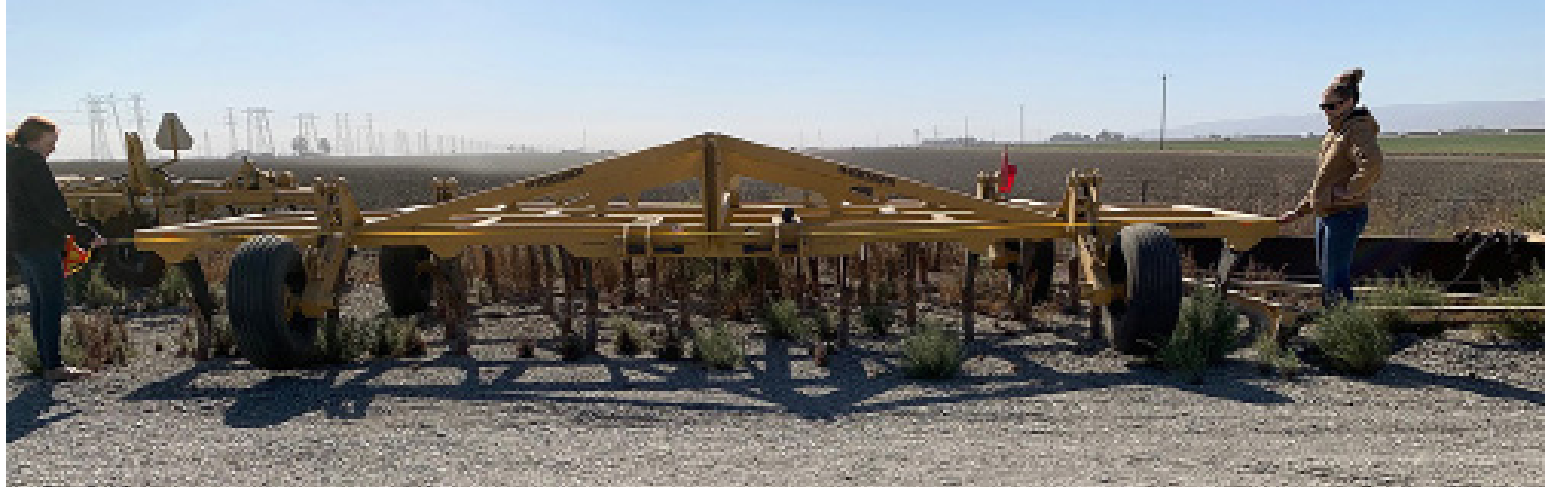
Chisel plow – can't be folded – blades very close to ground 11 ft long by 25 ft wide