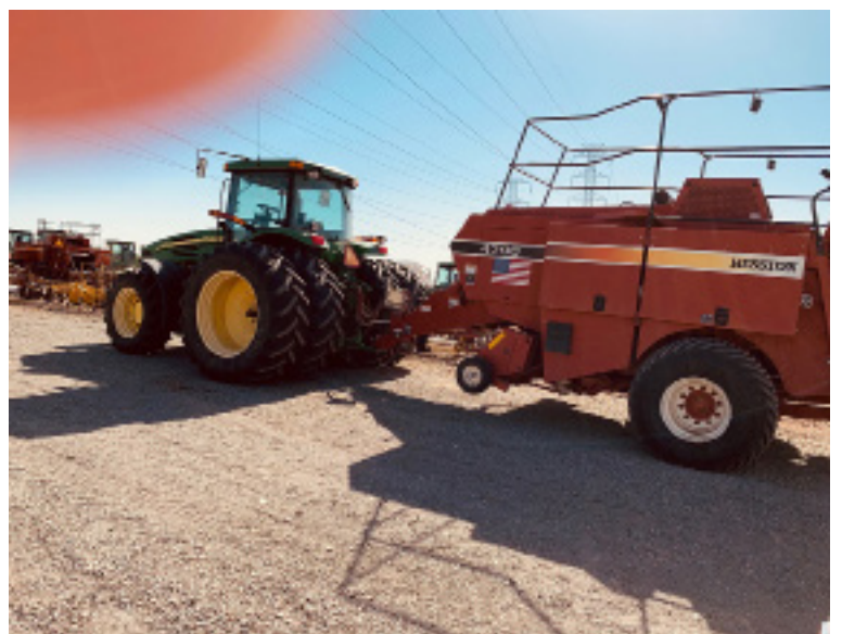
Tractor pulling hay baler