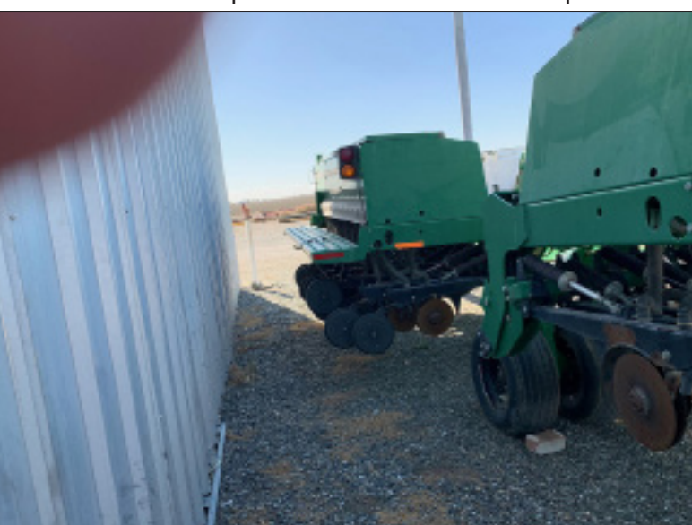
Grain drill folded into three sections Side 2 folded 26 ft long by 21 ft wide