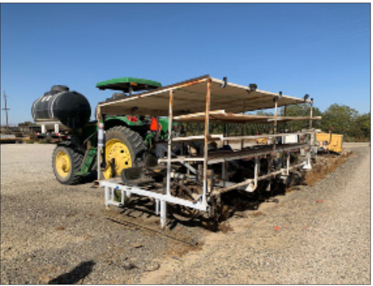
Planter Sled pulled by Tractor