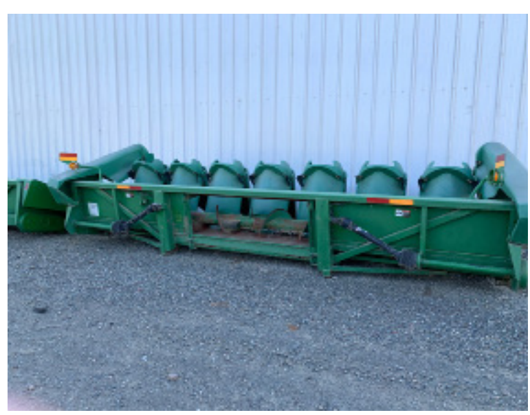
Sunflower header for harvester