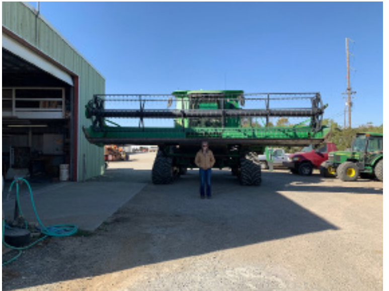
John Deere Harvester with header attached 26.5 ' wide by 17'6' tall 31t front to back