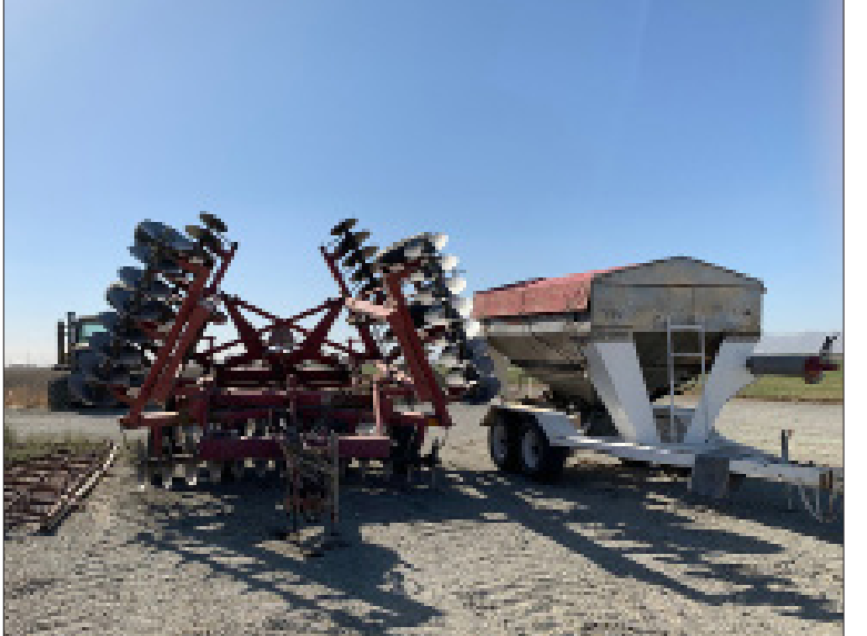
Stubble disc folded 3 ways 25.5 ft wide, 11 ft long folded