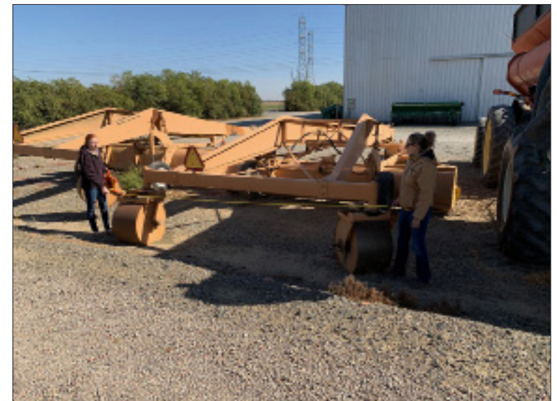
Landplane – bucket 16 ft wide 38.5 ft long x 13.5 ft wide