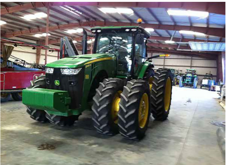
Tractor - there is usually at 15' or wider implement being towed behind the tractor