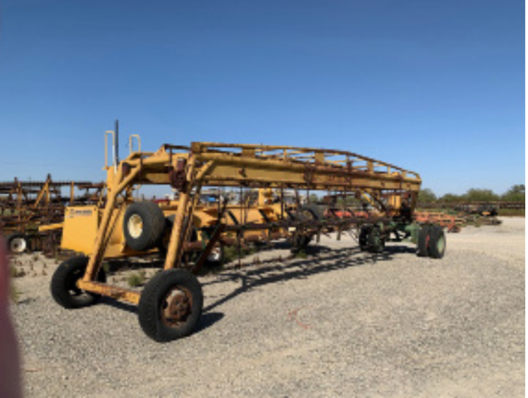
Carryall 40.5 ft long x 10.5 wide Implement being transported often 4 - 5 ft wider