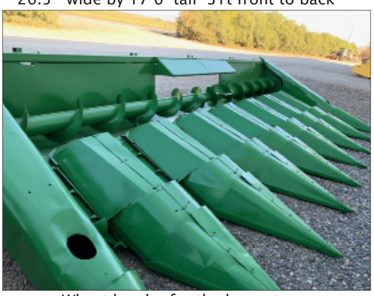
Wheat header for the harvester