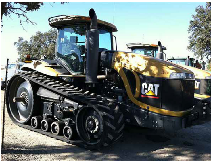
Tractor 24' wide by 11.5 ' long