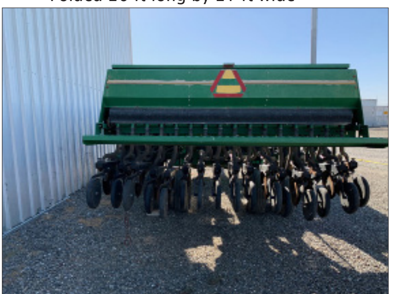
Grain drill folded into three sections Middle Section Folded 15 ft wide